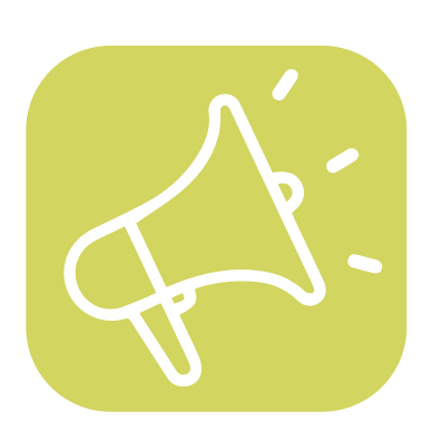
17 Active policies and positions